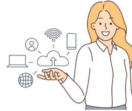
Host Entrepreneur (HE)